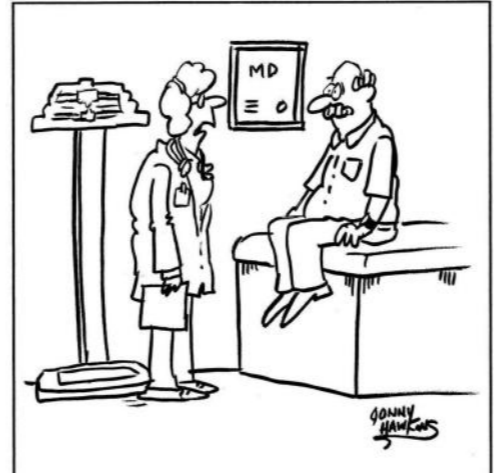
"You can still be the salt of the earth on a low sodium diet."

PRO-LIFE FUNDRAISING DINNER Thu 23 Feb: At Matilda Bay Restaurant - all proceeds benefit Pregnancy Help Australia which provides assistance to families in pregnancy crisis situations. $110/ticket, or $1,000/table of 10. web: Perth-Gala for Life