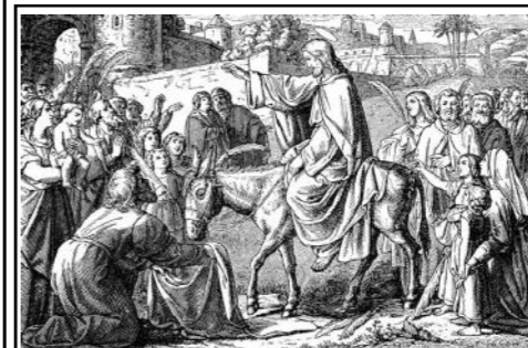
Hosanna to the Son of David!