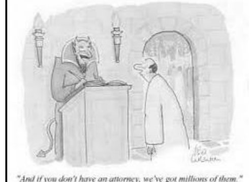
"And if you don't have an attorney, we've got millions of them."

BUILDING FUND TO DATE TOTAL in Building Fund: $208,451.77 BUILDING FUND PLEDGES Please note your bank reference like this: Your surname - Pledge. ONGOING EXPENSES insurance - $1,505.57 * underground power - $500.00 * Archdiocesan tax - $1,000.00 * air con service - $621.50 * Peter's Pence - $1,261.71 * FORMED parish subscription - $1,449.00 * TOTAL: $5,201.69